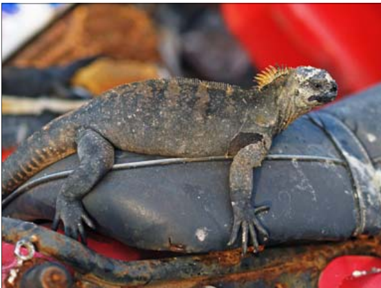
Larry Petterborg's Easy Rider