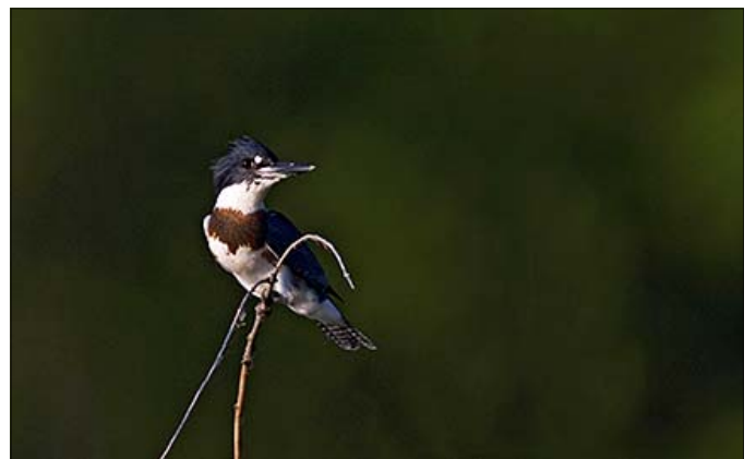
Laurie Snidow's Kingfisher