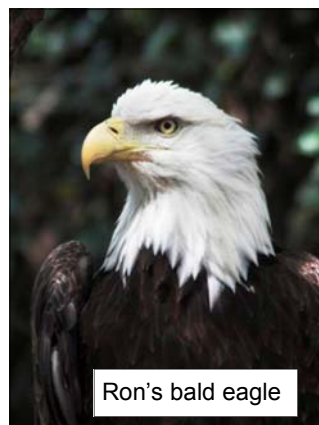
Ron's bald eagle