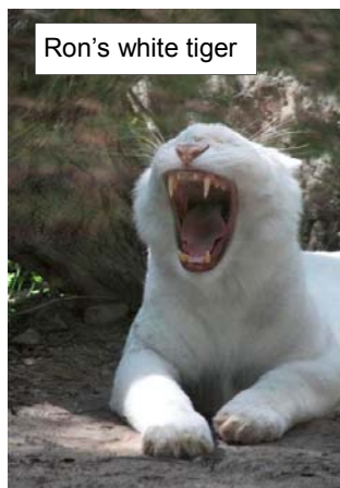
Ron's white tiger