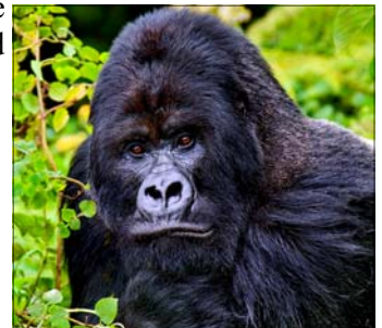
Eleanore's mountain gorilla

Her program includes covers shots of a Wildebeest migration as well as big cats and other wildlife in the area around the Mara River, in Kenya. And in Rwanda, she completed an arduous trek up a Volcano Park mountain to shoot the fabulous mountain Gorillas.