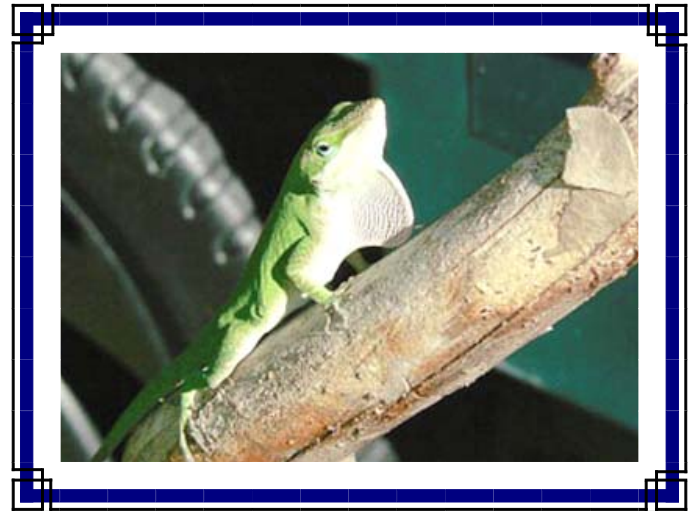
Retha Moulder's Geico Gecko