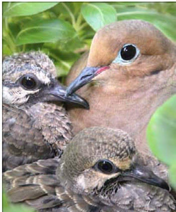
Jim's Mourning Dove Family

To better help the members learn and grow, in photography, we have decided to incorporate more "how to" nature photography tips and techniques into