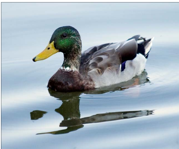
Harold Green's "Duck in Water"