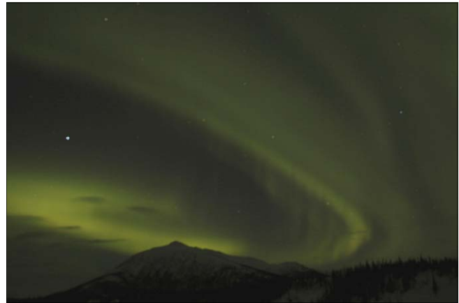
Peggy Evans' "Alaska Northern Lights"