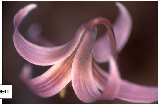
Trout lily

There will be a sign-up sheet at the February meeting, or you can send me an email to sign-up, at remarabito@att.net .