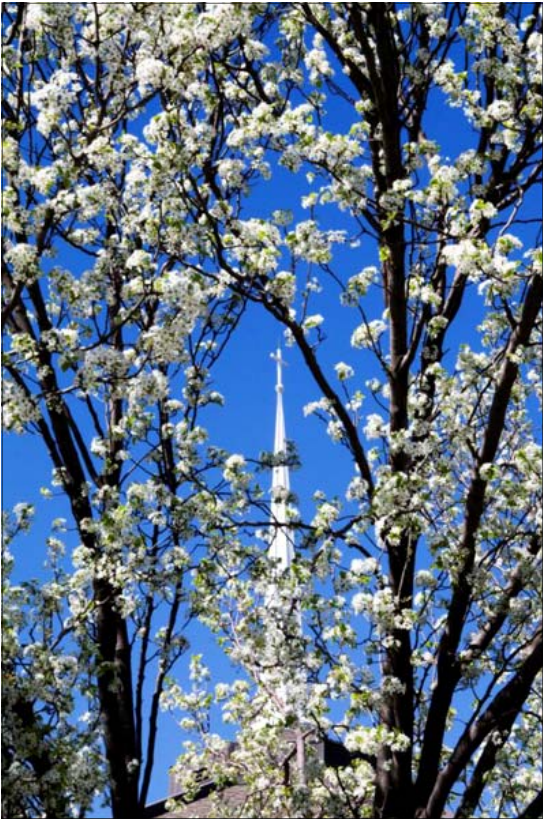
John Deals - "Steeple Framed With White Blossoms"

This space is intended to give members an opportunity to show off their images to other members of the club. You are encouraged to submit images to the editor, for display here in the future. Send jpg images, 100 dpi, at 3 x 4 inches, or so.