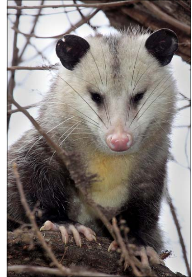
Jim's "Opossum" taken at White Rock Lake..