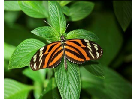
Ron's "Zebra butterfly"

If the participants get their images to me on time, I'll put together a slide show, for the July meeting.