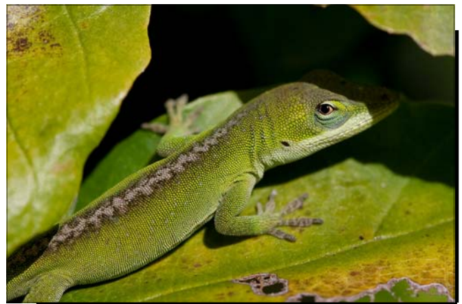
Laurie Snidow's "Hiding in Plain Sight Full"