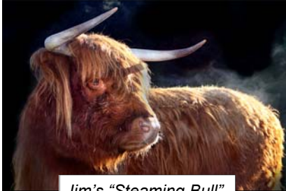
Jim's "Steaming Bull"

H appy 4th of July! Although it may be too hot to spend much time outdoors, Texas summers do provide an opportunity to get caught up on your Photoshop projects.