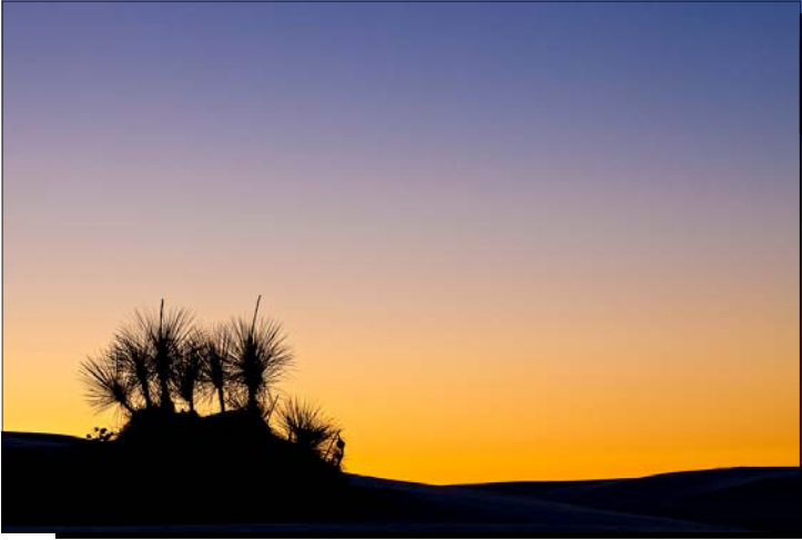
Anita Oakley's "White Sands"

This space is intended to give members an opportunity to show off their images to other members of the club. You are encouraged to submit images to the editor, for display here in the future. Send jpg images, 100 dpi, at 3 x 4 inches, or so.