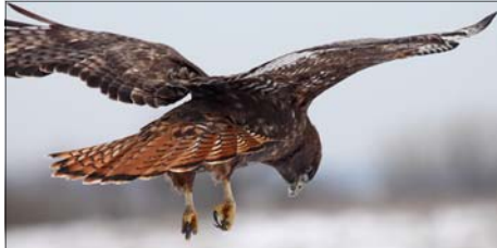
Jim's "Red Tailed Hawk"

Spring is here and so are the opportunities to take some great nature photographs! Not only are the wild flowers plentiful, but the birds are searching for food for their hungry young, making for good photo opportunities!