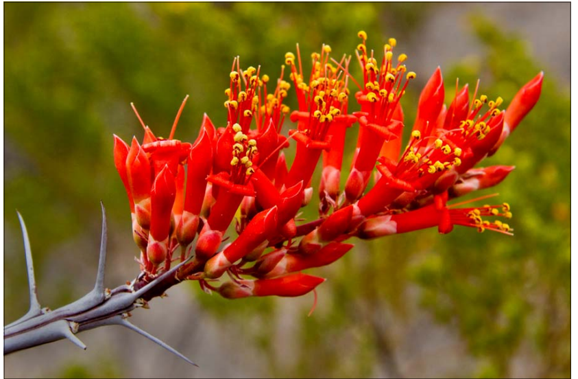
Harold Green's "Ocotilla Blossom"