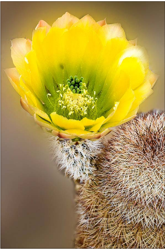
Jack Harrison's - "Cactus Blossom"

This space is intended to give members an opportunity to show off their images to other members of the club. You are encouraged to submit images to the editor, for display here in the future. Send jpg images, 100 dpi, at 3 x 4 inches, or so.