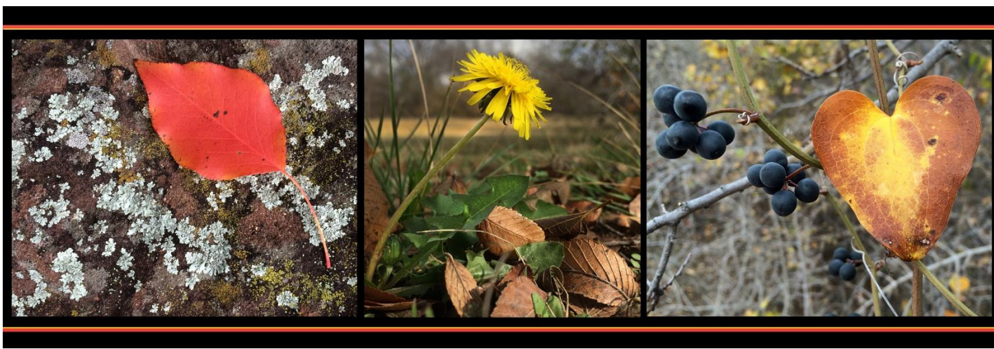
Oak Creek Park Carrollton