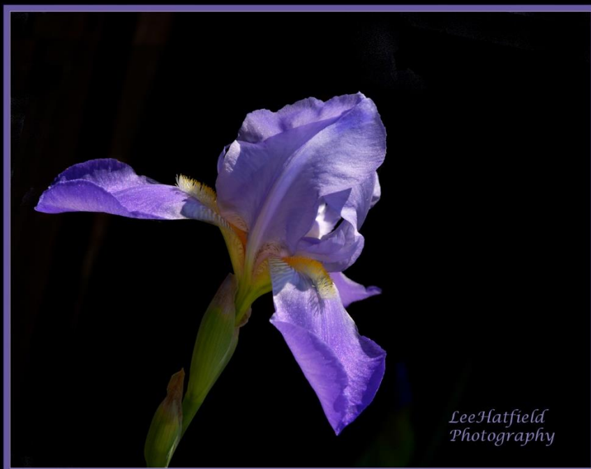
Iris in Sunlight