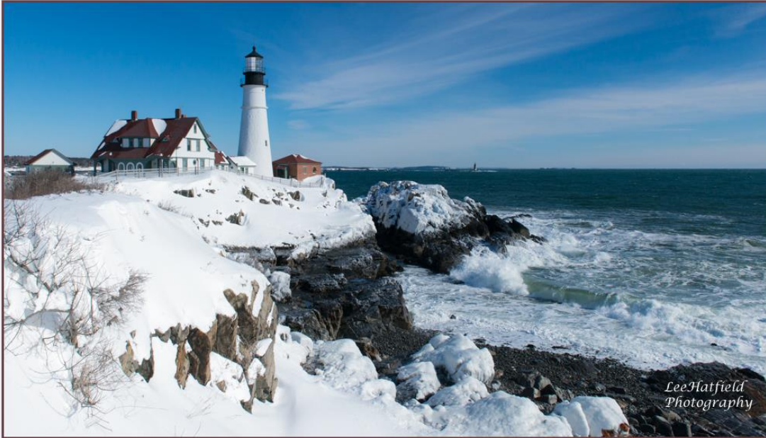
Portland Head Light House, Cape Elizabeth, Maine