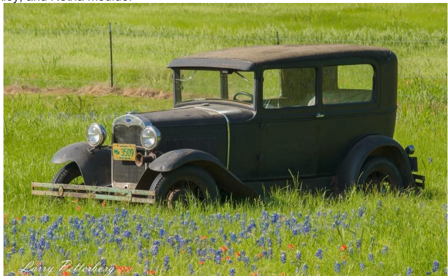
Henry, a 1930 Model A Ford in a field near Ennis.