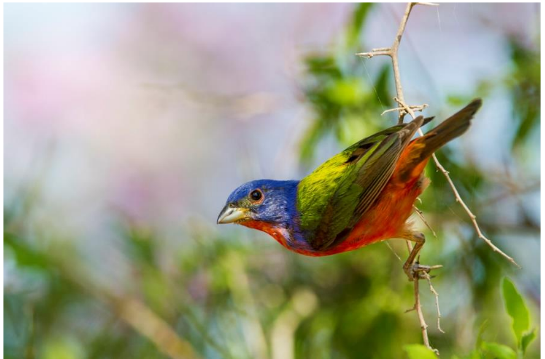
PAINTED BUNTING AT THE SANTA CLARA RANCH