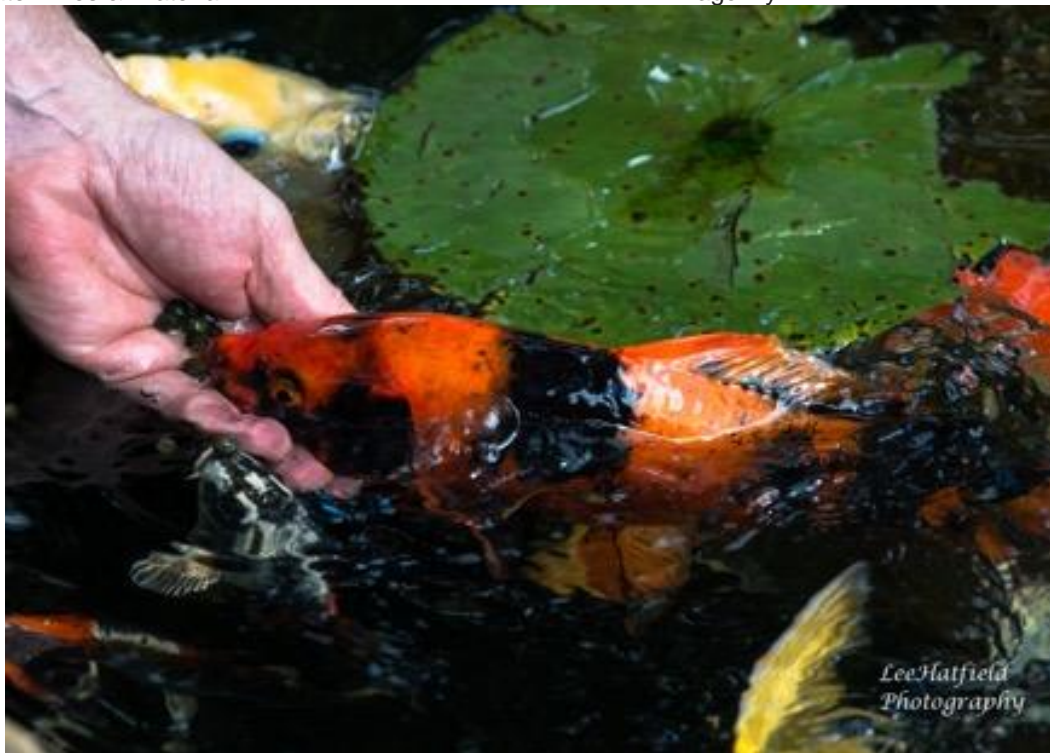
Koi Eating From the Owner's Hand