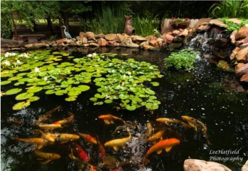
Koi Pond with Water Lilies & Waterfall