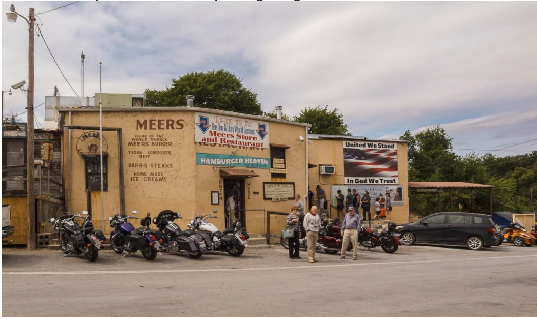
Part of the Heard Herd at Meers for lunch.

Perhaps the most memorable part of the field trip was getting to know some of our club members a little better!