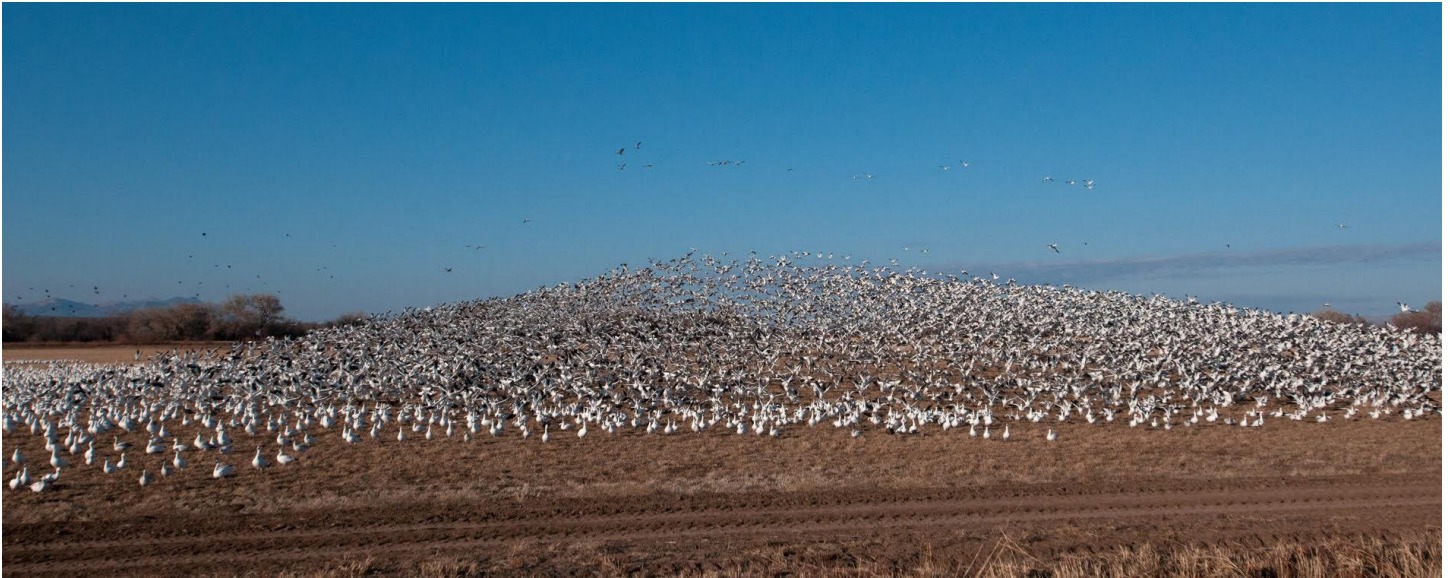
Snow Geese at Bosque del Apache by Lee Hatfield

Landscape and nature wildlife photography options will include sandhill cranes, geese, hawks, deer, ducks and wild boar plus sunrise and sunset. A side trip to the Very Large Array may give us a chance to photograph pronghorn antelope. We have 17 members signed up. Please make your lodging reservations ASAP with best hotel options in Socorro, NM.