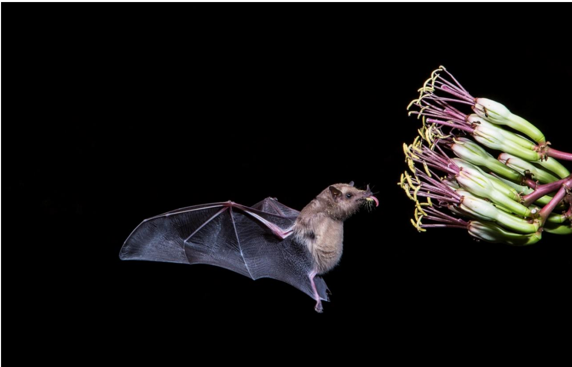
Lesser Long Nosed Bat by Larry Pettersborg, 14 pts. 1 st Place.