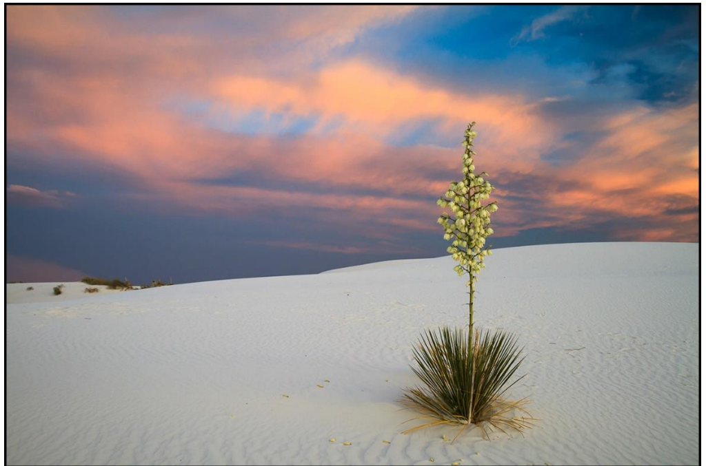
Sunset in White Sands by Linda Grigsby, 13 pts.