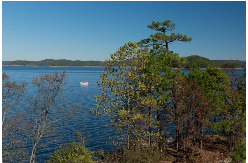
Tour Boat on Broken Bow Lake