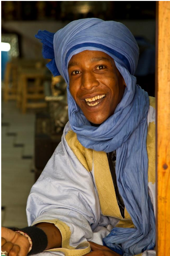
Blue Man, Essaouira, Morocco