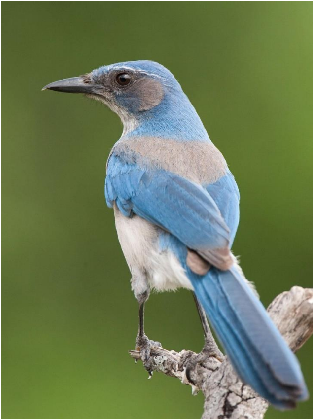
Western Scrub Jay