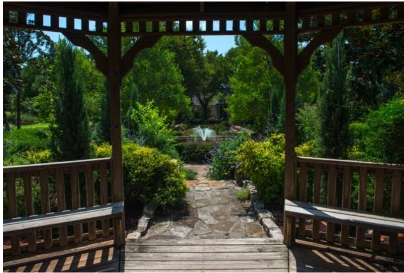
View of Chandor Gardens from Pergola