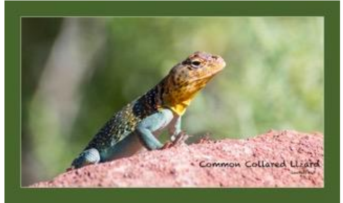
Common Collared Lizard