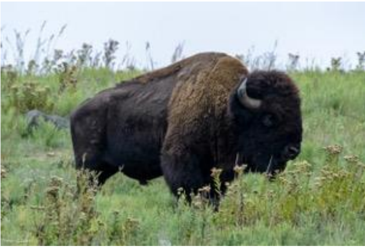
American Bison