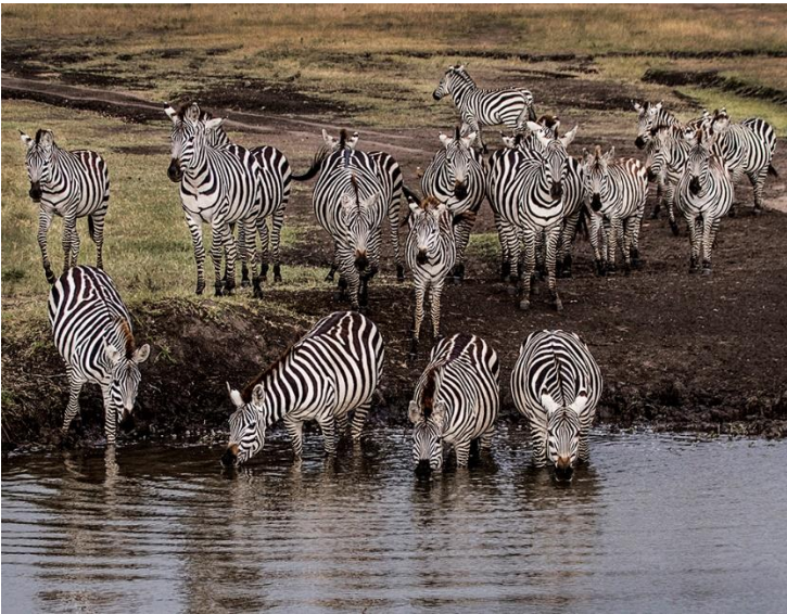
Waiting Their Turn by Jack Twiggs, 10 pts