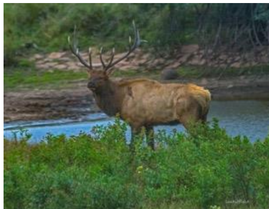
Bull Elk

Saturday night brought thunderstorms and the path was pretty wet Sunday morning into Jed Johnson Lake. We met twice for dinner at the Old Plantation Restaurant in Medicine Park and noted that the menu has not changed since last year. Lunch at Meer's on Saturday was just okay but Sunday breakfast at Ann's was terrific with cherry cream pie piled high with merengue!