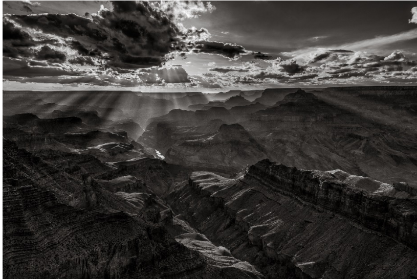
2016 Best of Show