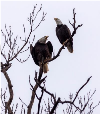
American Bald Eagles at Hagerman National Wildlife Refuge Jan. 2017.

In this space, I plan to highlight things for North Texas nature photographers to see and do. Please feel free to send me items of interest to share with the club. Thanks.