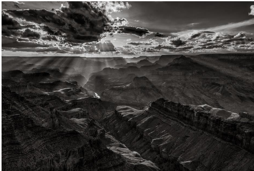
2016 Best of Show