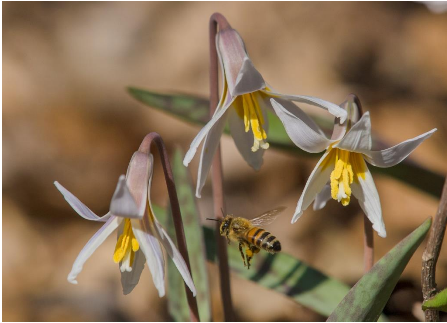
Trout Lilies and bee