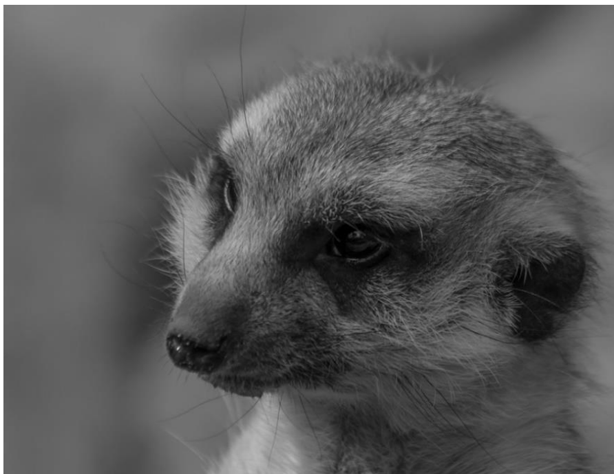
Meercat by Bud Mallar. 10 pts.