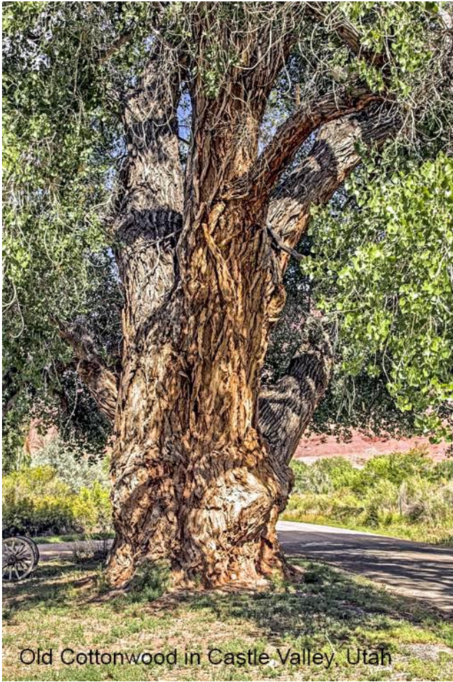
Old Cottonwood in Castle Valley, Utah