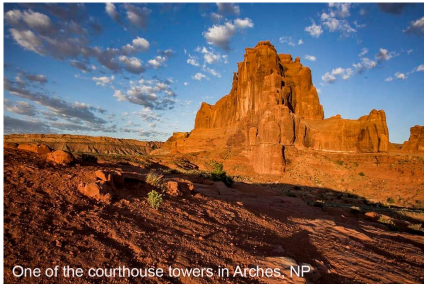
One of the courthouse towers in Arches, NP