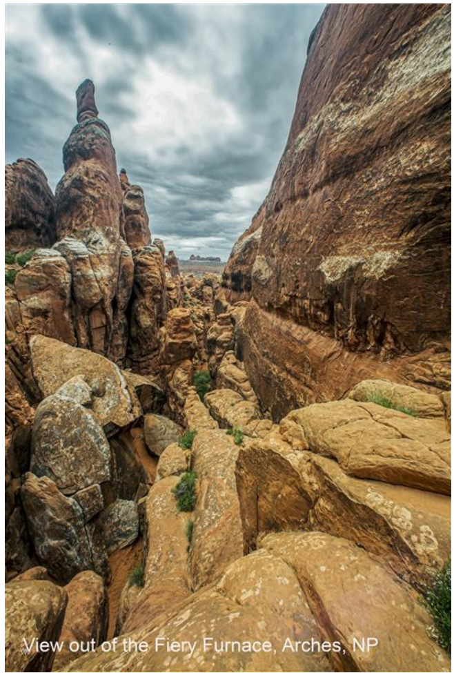
View out of the Fiery Furnace, Arches, NP