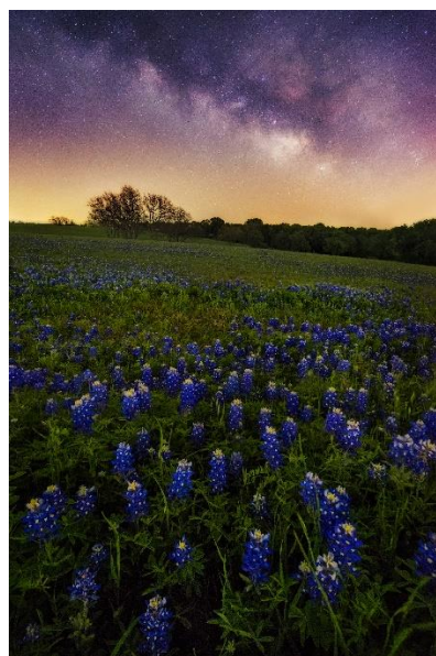
Texas Hill Country