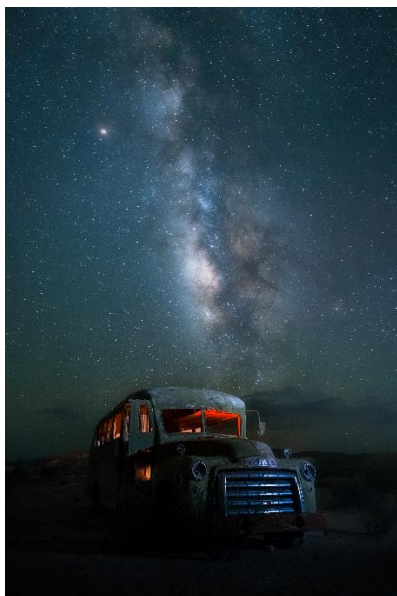
Big Bend, TX