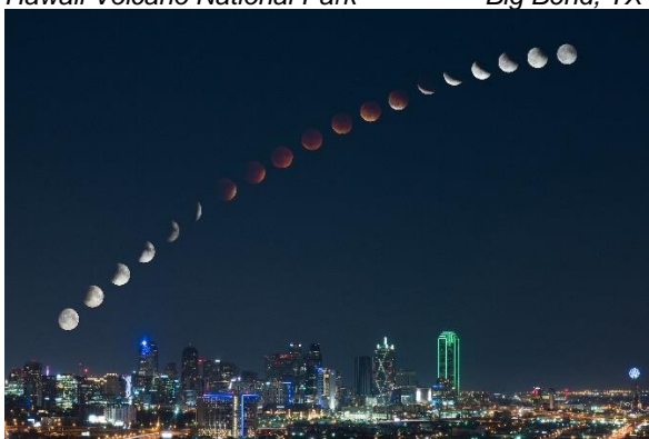
Dallas, TX Skyline