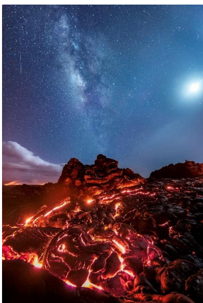
Hawaii Volcano National Park

Below are a few examples of his work from his website.