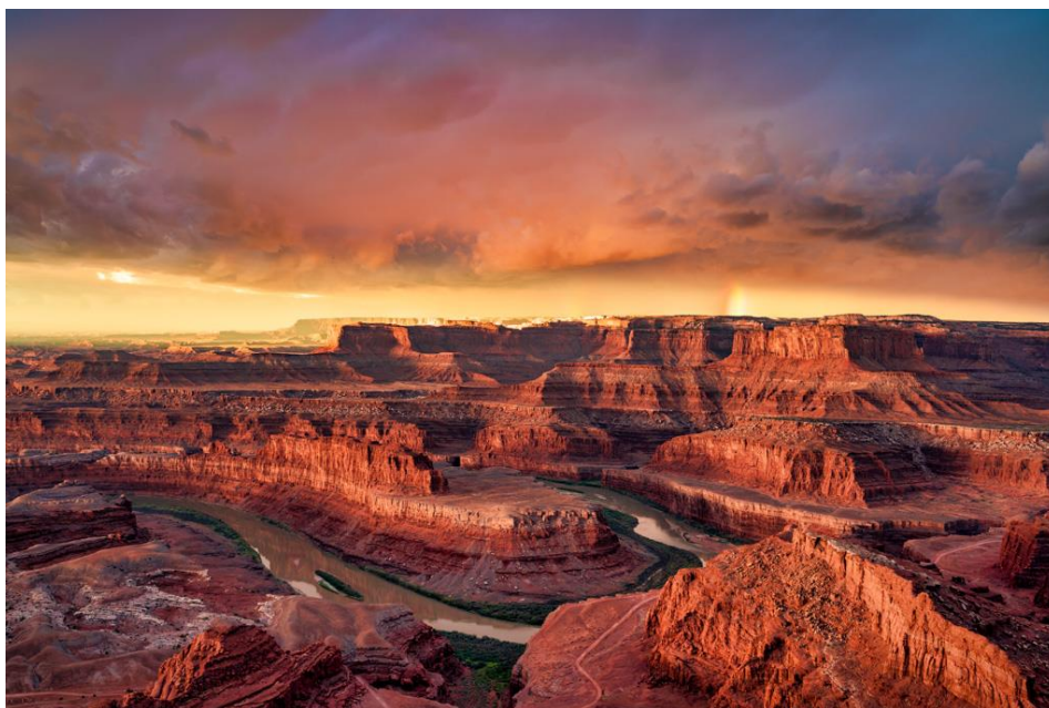
Dead Horse Point