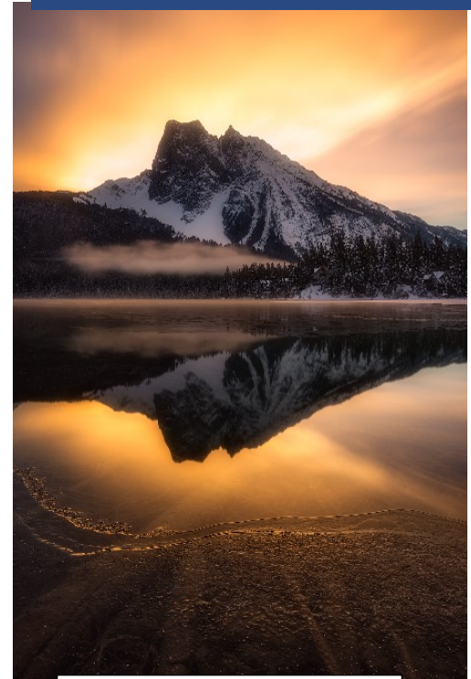
Emerald Lake

President's thoughts 1 Speaker – Mike Mezeul II 2 Heard Photo Contest 3 - 4 Roadtrips 5 Field Trip News 6 – 7 News 8 GSCCC Convention 9 Let's Get Social 10