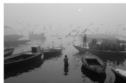
Varanasi, India