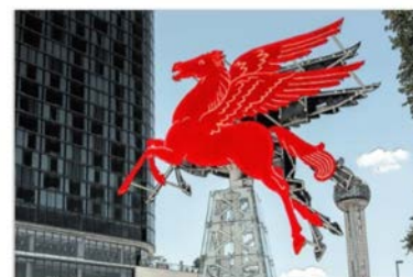
Pegasus Dallas, Texas