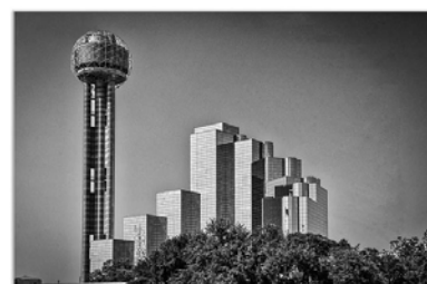
Reunion Tower Dallas, Texas