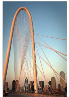
Margaret Hunt Bridge Dallas, Texas