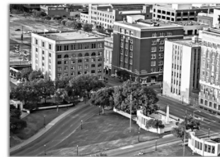
Dealey Plaza Dallas, Texas

Examples of Mike’s creative work can be found on www.mikeshermanphotography.com