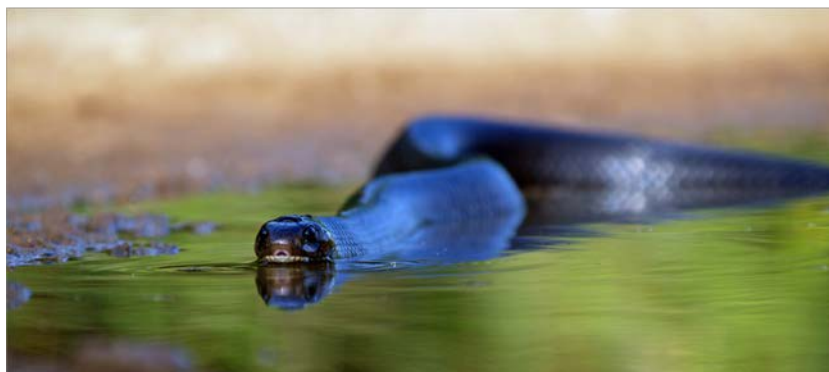
Texas Indigo Snake