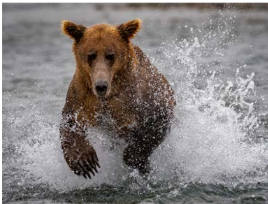
Alaskan Brown Bear

If someone were to ask me what lens I would choose, if I could only photograph with one, I would pick a telephoto. I think that the advantages of using a long lens rather than a wide-angle lens far outweigh the loss of the broad perspective. For this session, I will show that a telephoto lens is good for many more subjects than just birds. We will discuss the advantages and disadvantages of long lenses and techniques to obtain sharp images. Join us for the morning and perhaps you too will agree that getting close while maintaining your distance is where it's at.