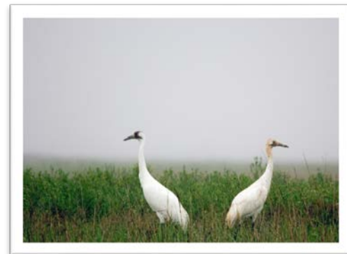
Whooping Cranes by Earl Nottingham