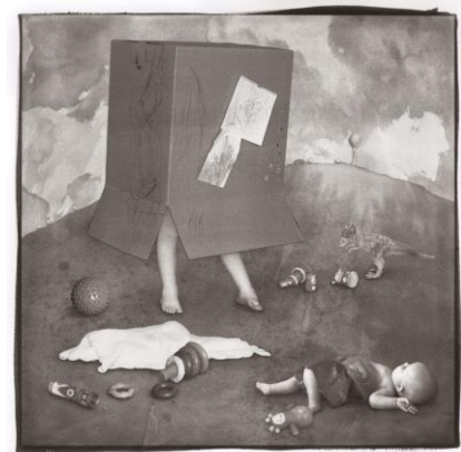
"Not just a box"