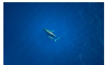
Humpback whale & offspring – Open water