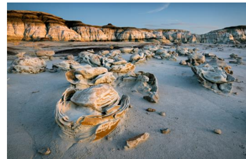
Cracked Eggs – Bisti Badlands, NM Sunset