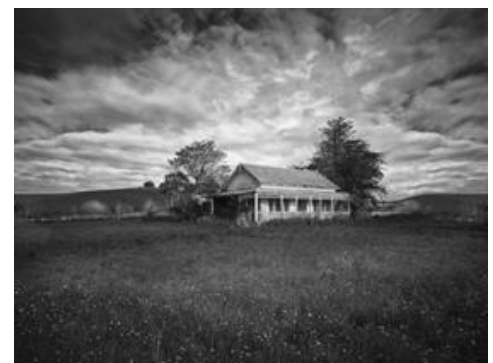
Abandoned Station - Australia