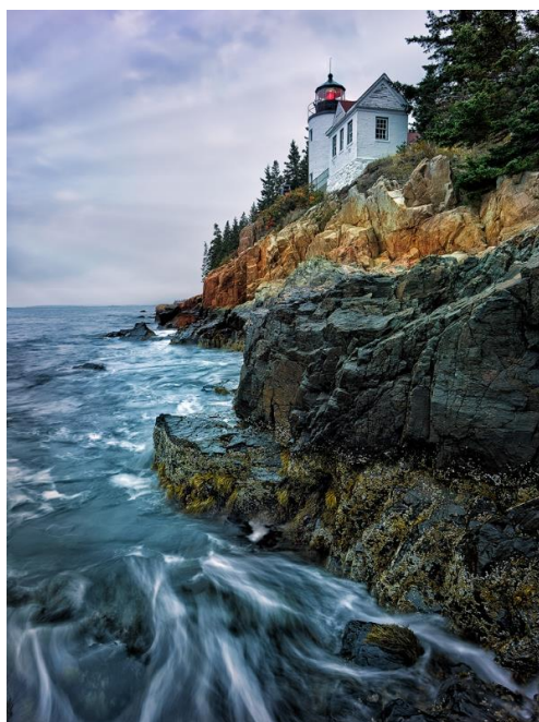
Bass Harbor Lighthouse