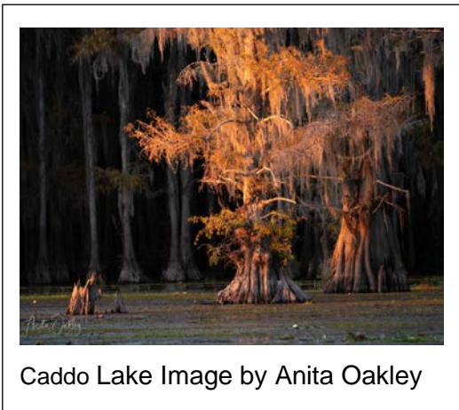
Caddo Lake