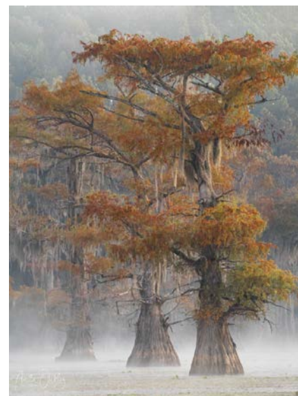
Caddo Lake