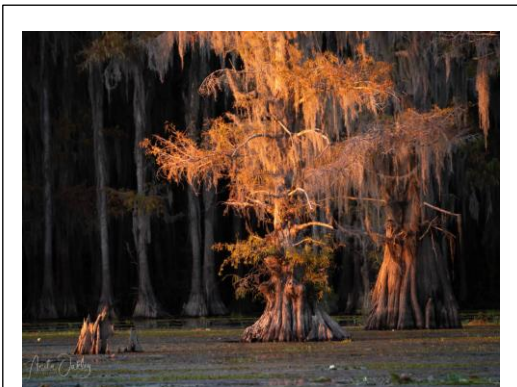
Caddo Lake