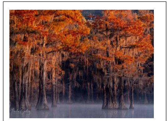
Caddo Lake image by Anita Oakley