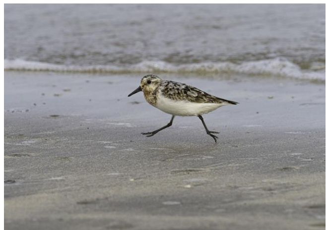
Sanderling