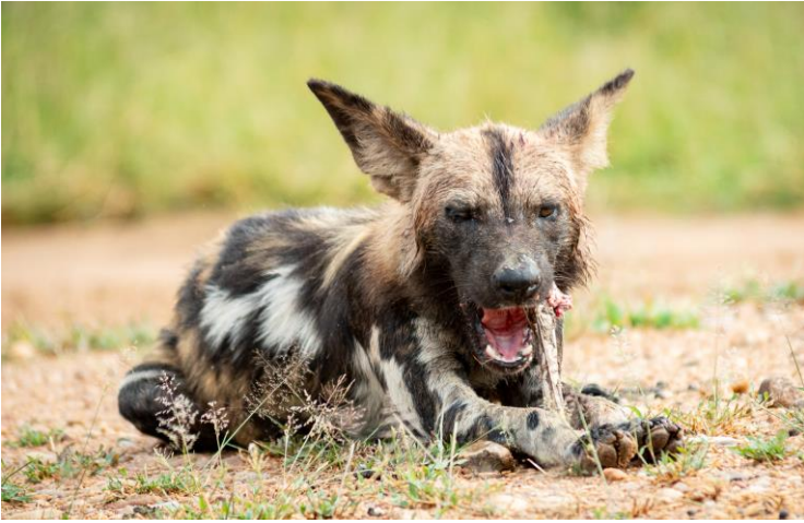
African Wild Dog