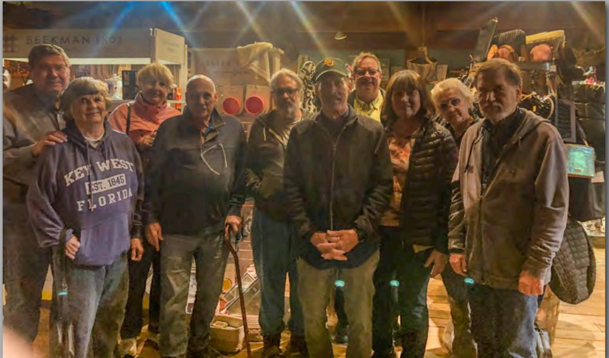
Surviving the Tornado Warnings: The Brave Beavers Bend Group

Saturday morning, we were able to see wind damage in the park. A few blown over trees, broken limbs and roads carpeted with leaves. The weather did not interfere with our photography. Sunrise and sunset Saturday were not great but Sunday morning gave us a nice sunrise with some fog rising from the water.