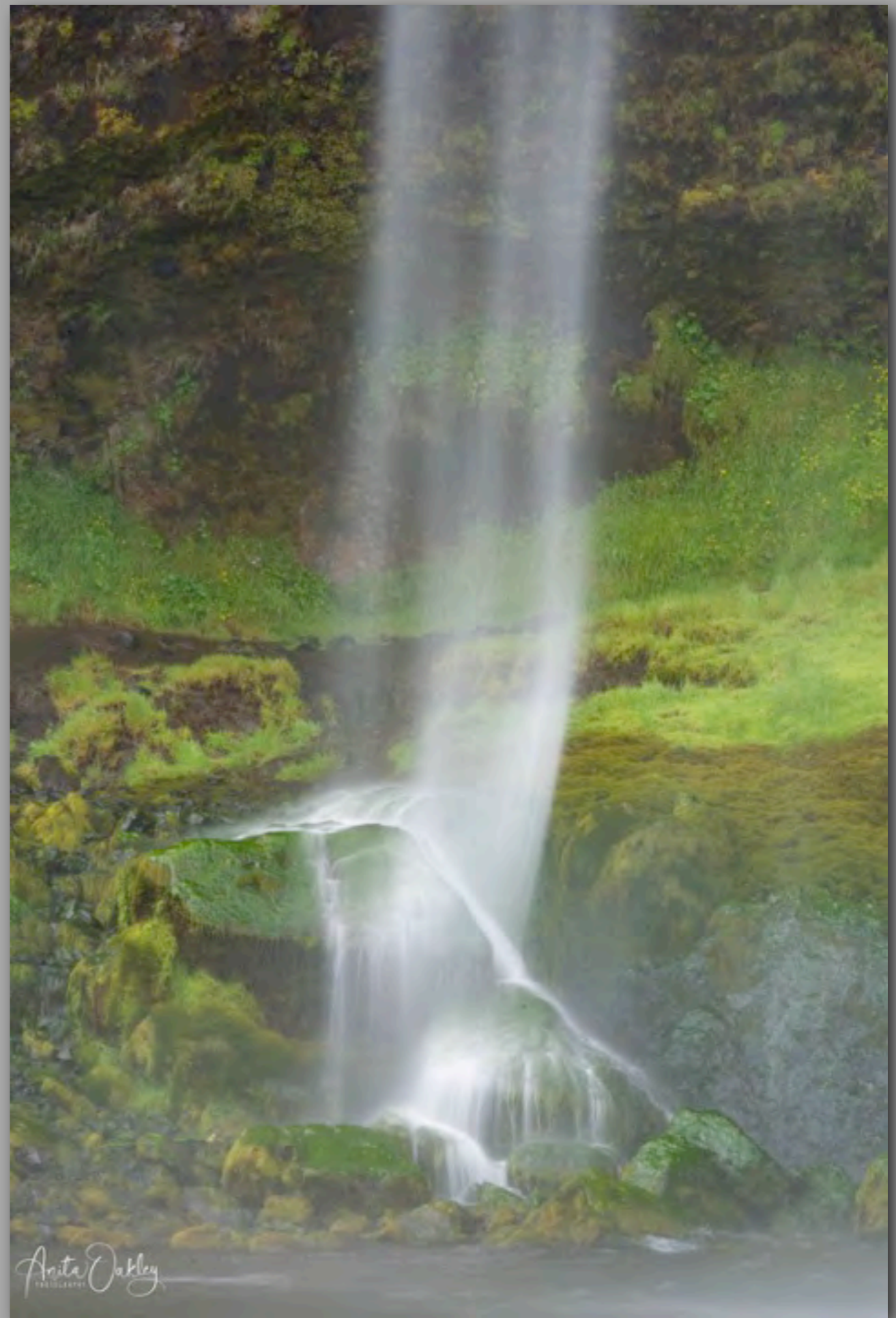
Waterfall on the Side, Anita Oakley