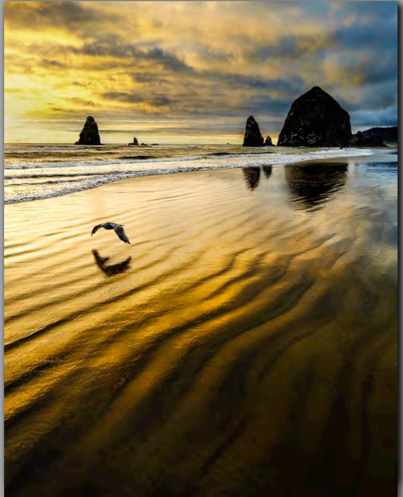
2017 Members Choice Winner

Photos will be accepted until MIDNIGHT, December 8, 2022 . Images will not be accepted after that time.