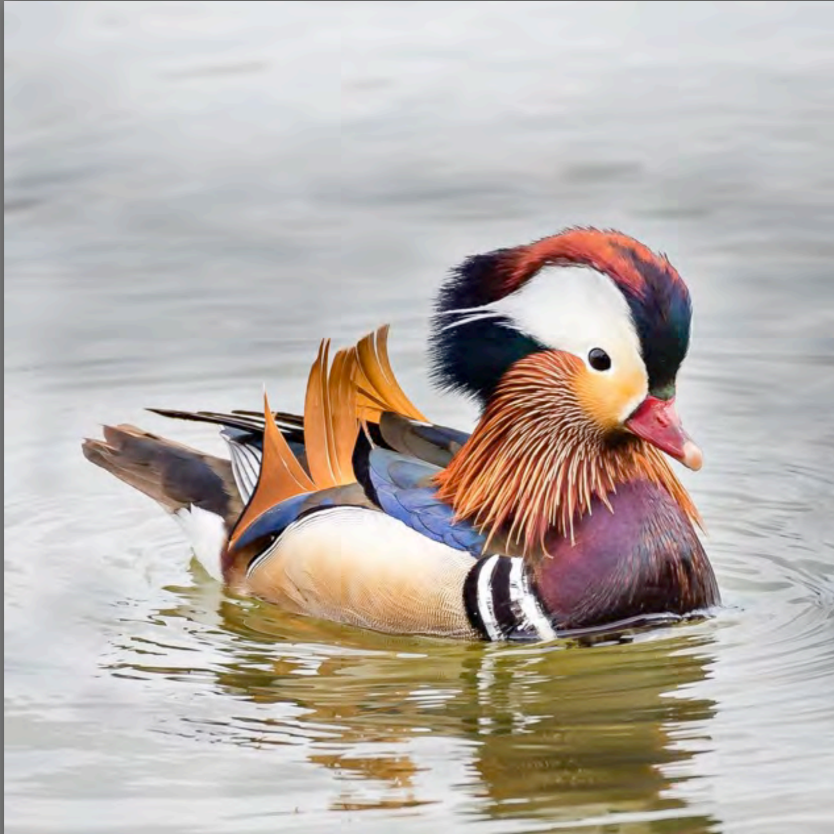
Mandarin Duck