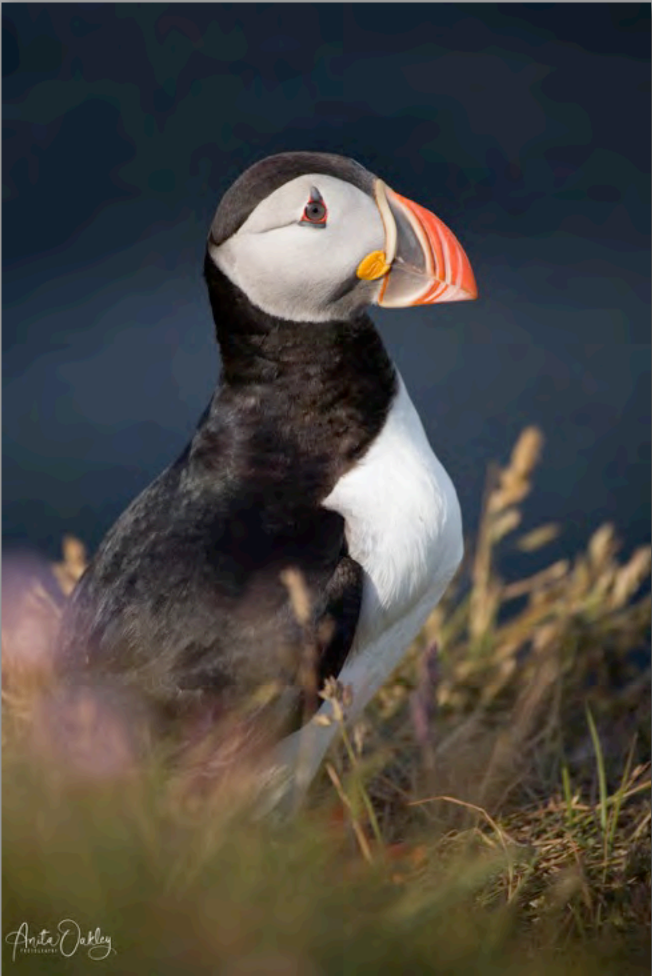
Best Side, Anita Oakley