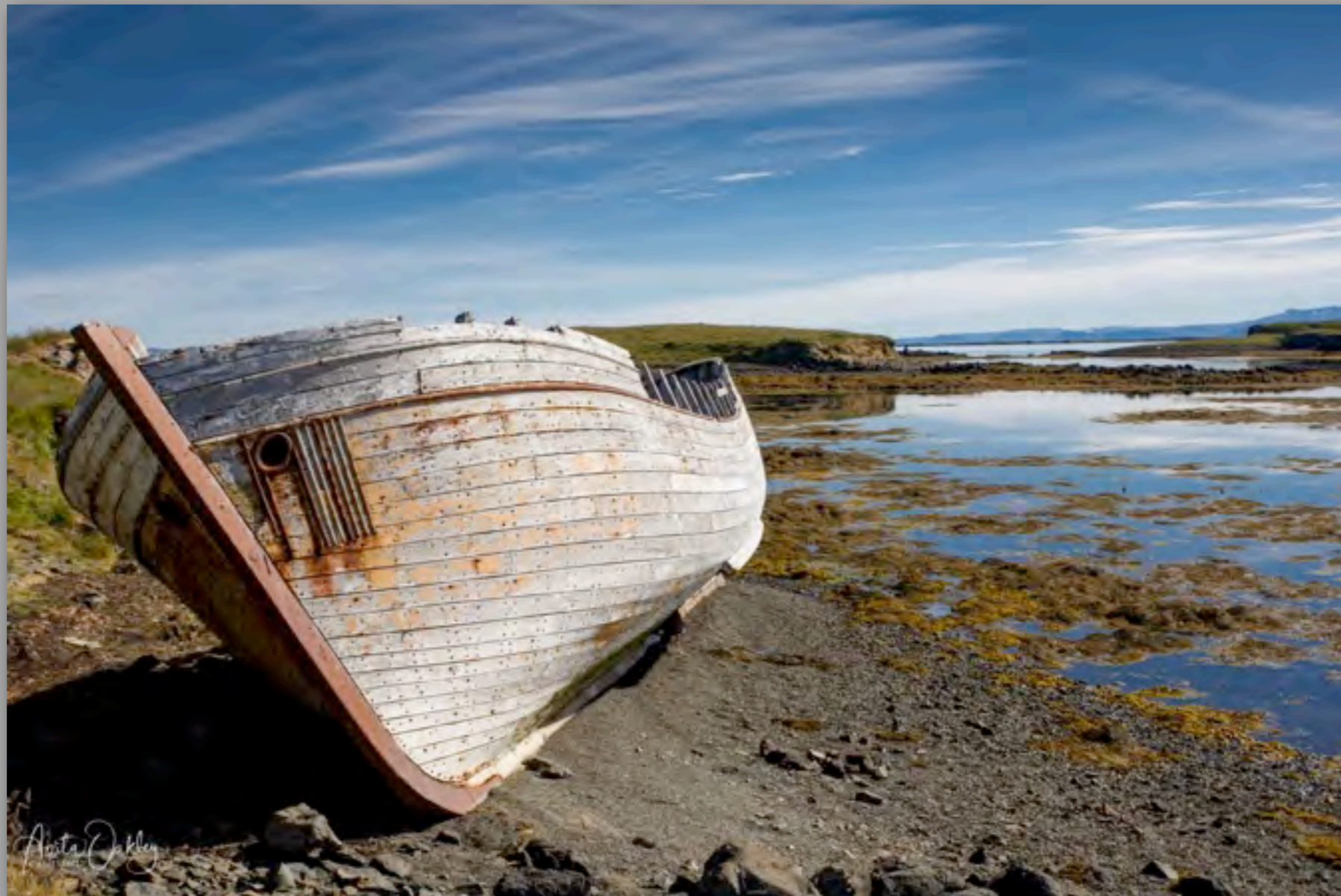
Flattey Island Wooden Boat