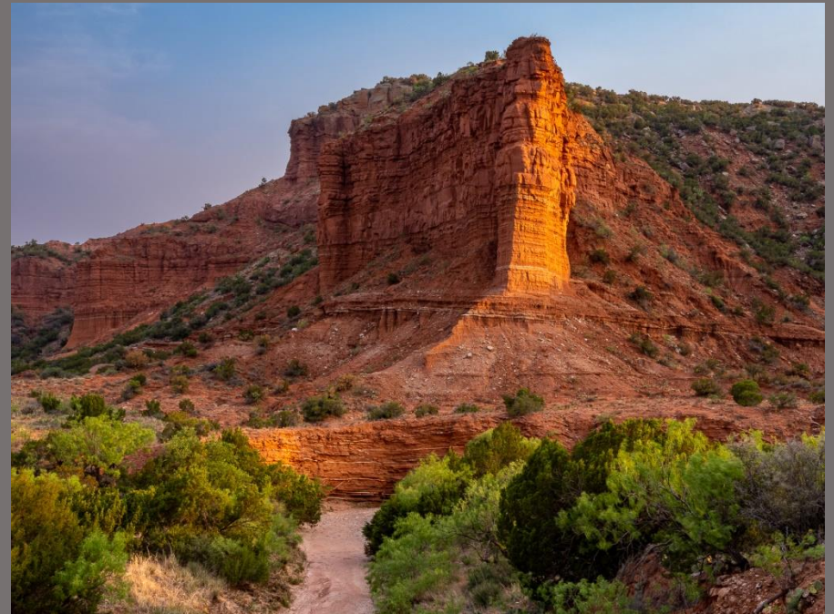
Caprock Canyon by Larry Petterborg