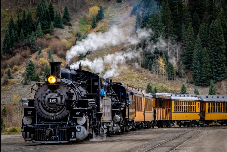
Durango and Silverton Narrow Gauge Railroad