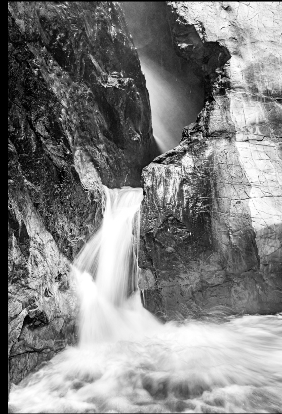
Box Cañon Falls

There was so much more to see, but at the end of 10 days, it was time to head home.