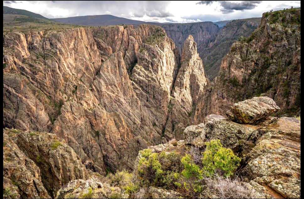
Black Canyon of the Gunnison NP