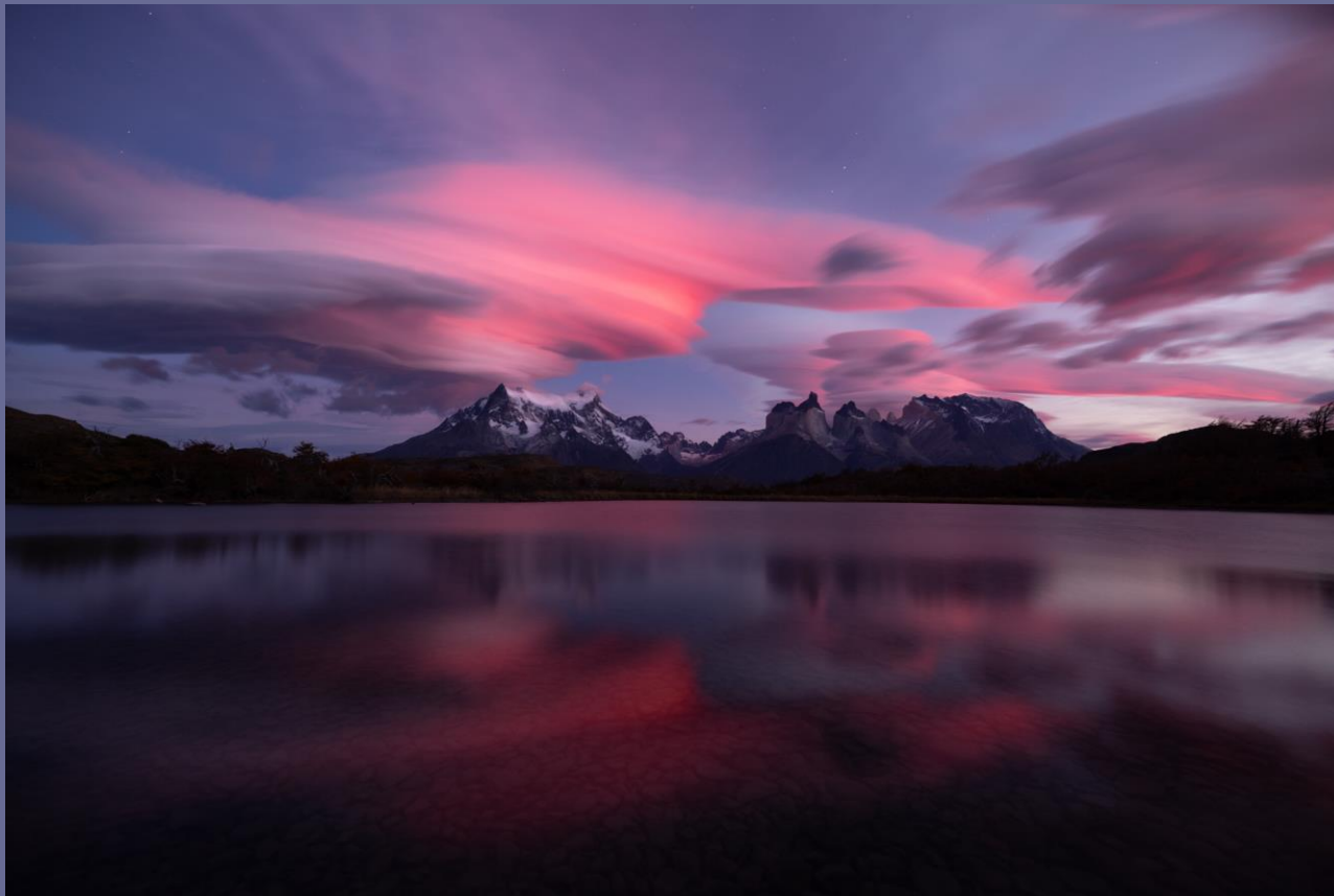
"Predawn over Torres del Paine".