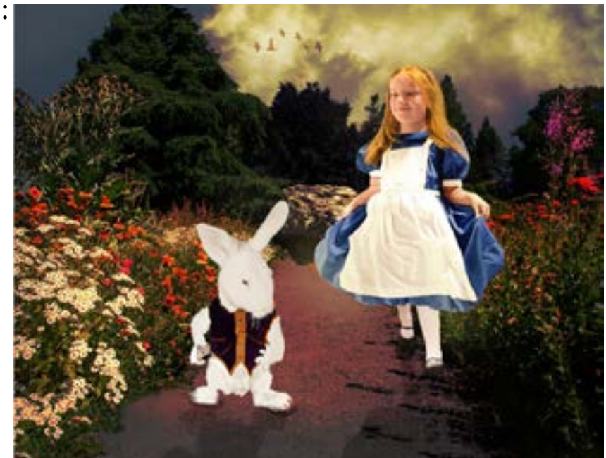
My first composite

- Photoshop and Creative Design Training